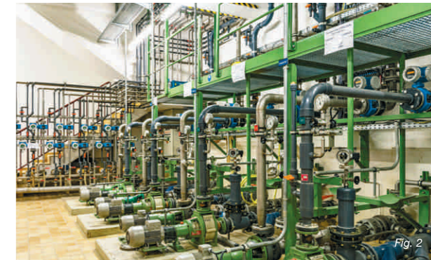
Pump cellar of the Rhine monitoring station

The RMS not only sounds the alarm as soon as the concentration of already known substances in its monitoring programme is increased, it also warns in the case of unknown substances. Following the alarm, water samples are taken at specific points by drinking waterworks and by the on-call water protection services of the affected cantons. In addition, reserve samples are taken at the main wastewater treatment plants (WWTP). These samples are analysed promptly in the RMS laboratory and serve to identify the originators of the pollution. For example, in 2013 it was found that the Rhine was polluted with 80 kg of methadone. The heroin substitute had apparently been unintentionally released into the waste water during production and had not been sufficiently degraded in the treatment plant.