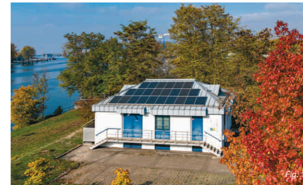
Building of the Rhine monitoring station directly on the Rhine