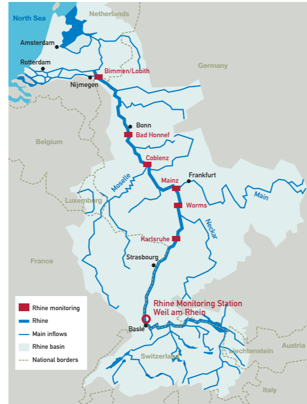
Rhine catchment area and location of monitoring stations on the Rhine

As soon as the measurements indicate that relevant quantities of a pollutant have entered the Rhine, the RMS triggers an alarm. Regionally or, depending on the severity of the contamination, also internationally. The primary purpose of the alarm is to protect the drinking water treatment facilities of the city of Basle and other waterworks located downstream. Around 22 million people obtain their drinking water from the Rhine. But aquatic organisms and their habitats must also be protected. In the event of an alarm, an attempt is made to identify the cause of the pollution as quickly as possible in order to stop its discharge into the Rhine.