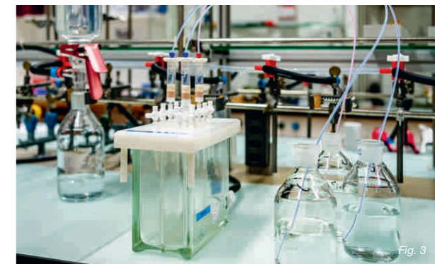
Water samples during analysis in the laboratory